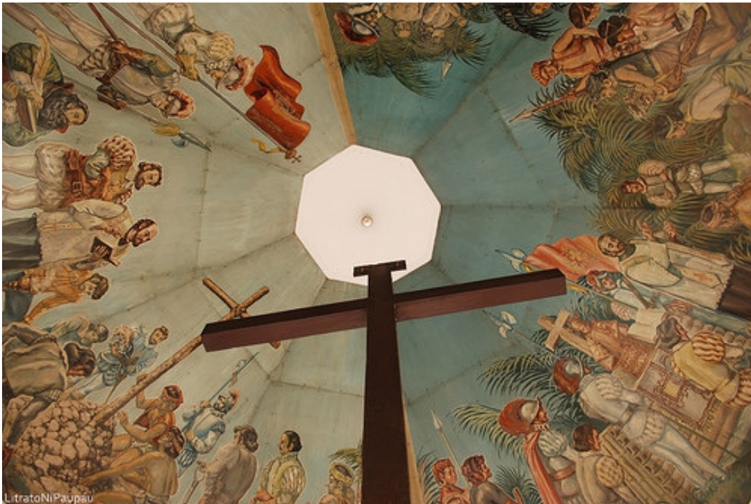
Magellan's Cross in Cebu, Philippines